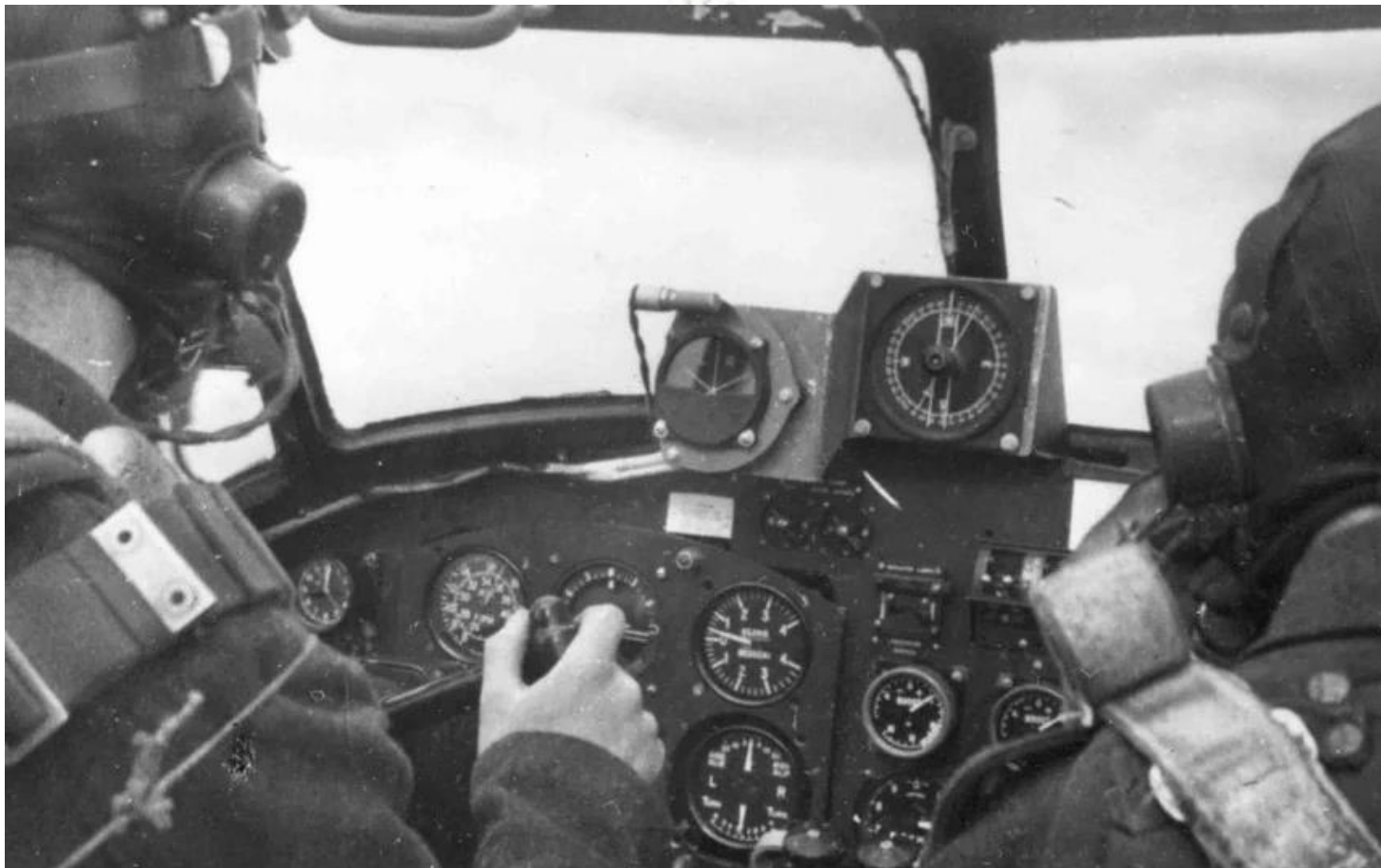
Inside a Lancaster Mk I cockpit in flight, RAF Holme-on-Spalding Moor